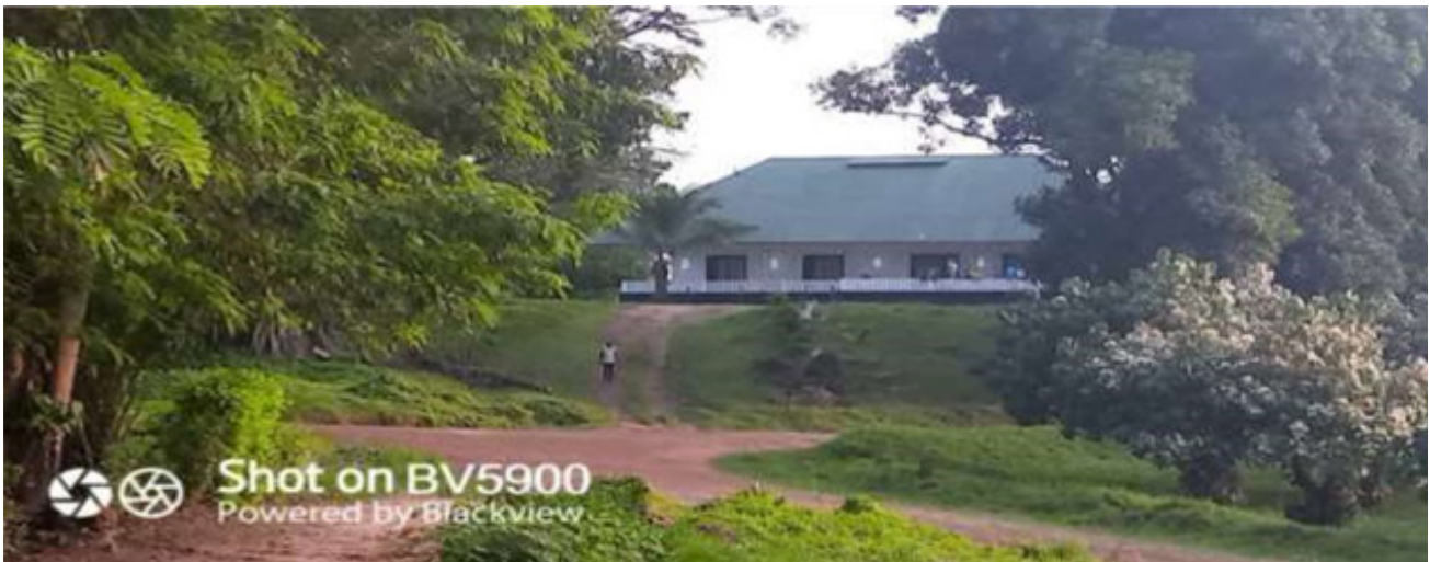
II.4 Guest house in LOKUTU

These different living environments preserve the honor of our different environments and promote the image of our beautiful country both nationally and internationally.