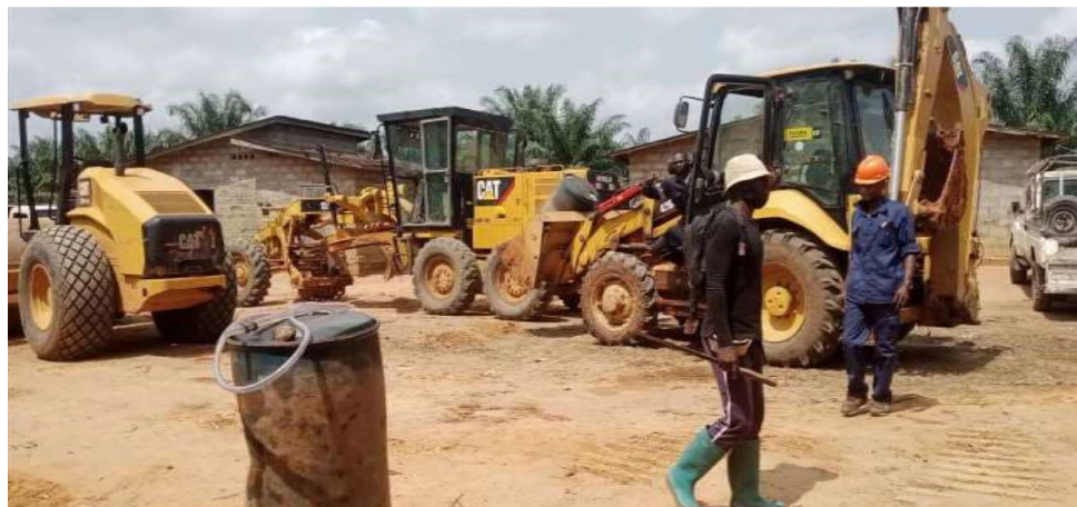
I.3.3. KKM2 construction team