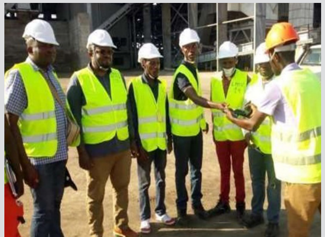
V.6.4 Work clothes during the period of KKM2