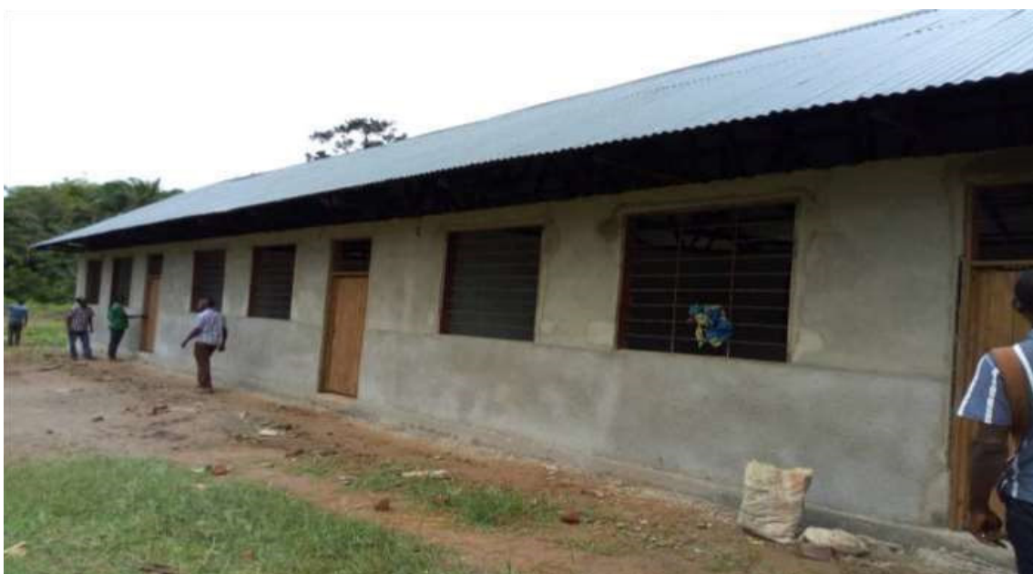
Fig 2: LIEKE Primary School in Yaoselo