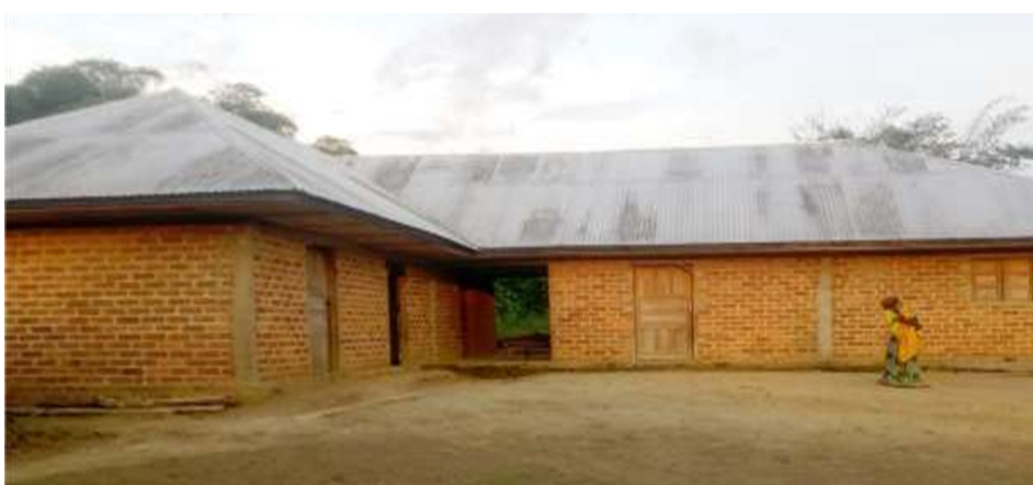
Fig 4. Health Center of the Mwando group (under construction)