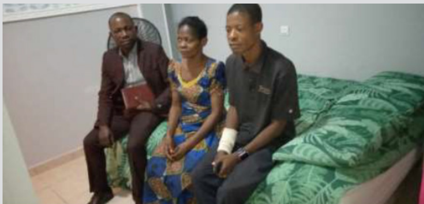
Photos taken in Kinshasa during convalescence