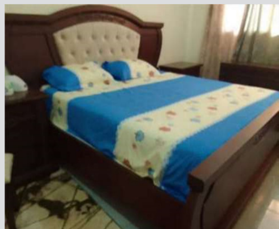
II.2 Guest house furniture