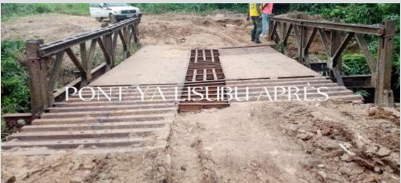
I.3.4. State of the Ya Lisubu bridge after the intervention of KKM2