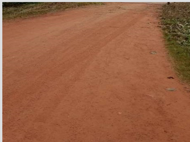
I.3.2. Road conditions during the KKM2 period