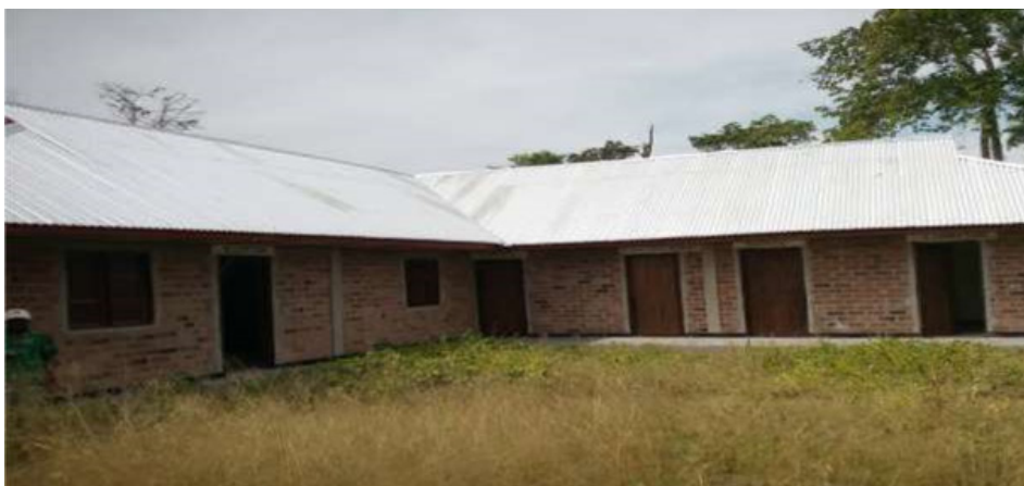
Fig 3. Health Center of the Yanongo group (under construction)

To guarantee the health of its agents and executives as well as the community in general, PHC/KKM2 has built and rehabilitated several health facilities in all its sites as shown in the images below.