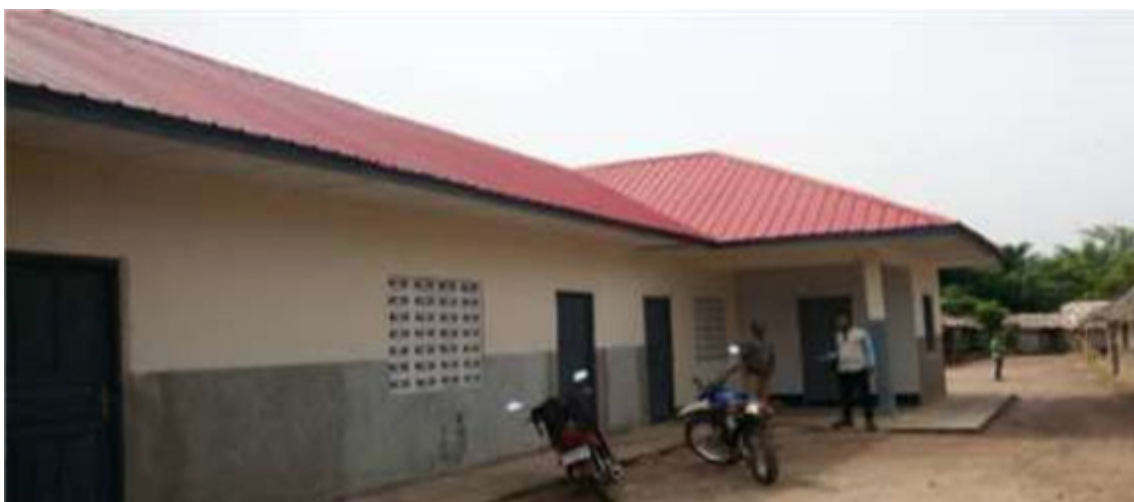
Fig 1. Medical Technical Institute of Mosite (I.T.M/CADAP)

To support the vision of the Head of State and that of the local community relating to basic education, PHC/KKM2 has built and rehabilitated some schools throughout its operational area; notably in the Bolesa, Yanongo,... groups as shown in the pictures below.