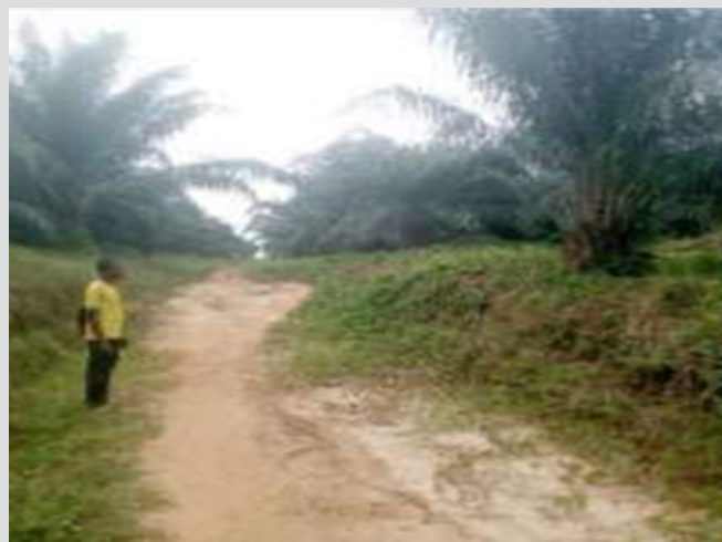
I.3.1. State of roads during the FERONIA period