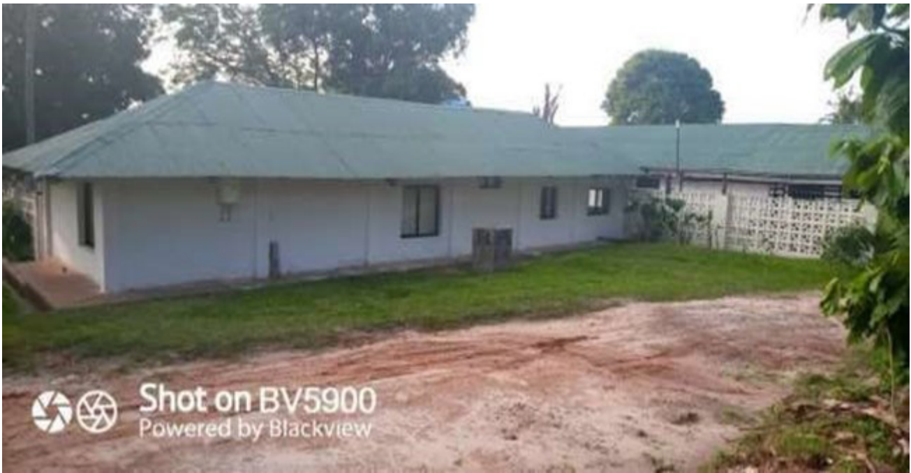
II.3 Guest house in LOKUTU