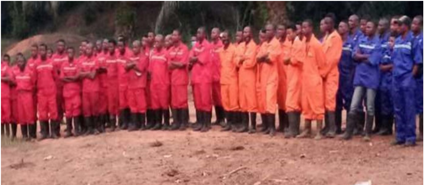
V.6.3 Work clothes during the period of KKM2

Nowadays, the KKM2 group solved this situation because all the agricultural workers wear the company's uniforms and work tools such as overalls, boots, helmets, gloves, machetes, etc., as shown in the photos below.