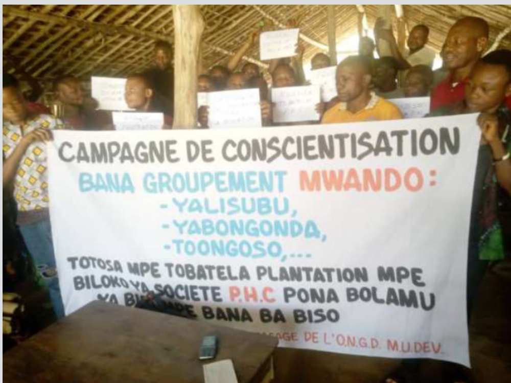
III.1 Awareness campaign