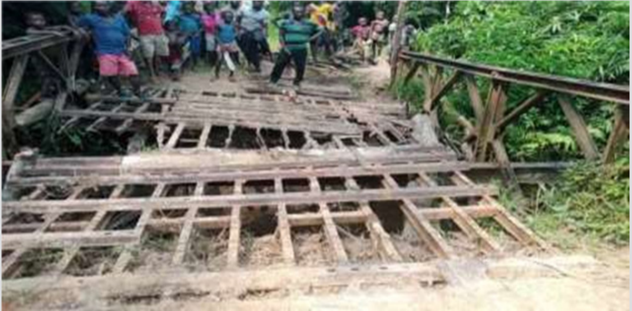
I.3.3. Condition of the Ya Lisubu bridge during the FERONIA period