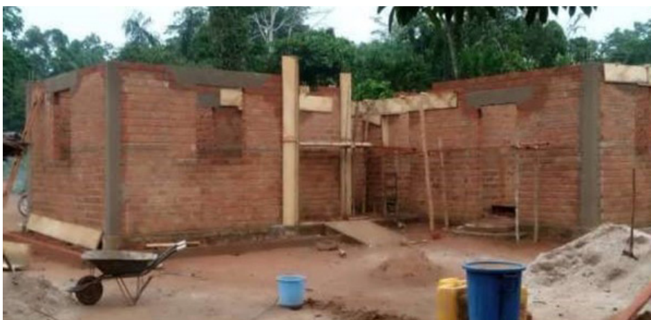
Fig 5. Bolombo 1 Health Center (under construction)