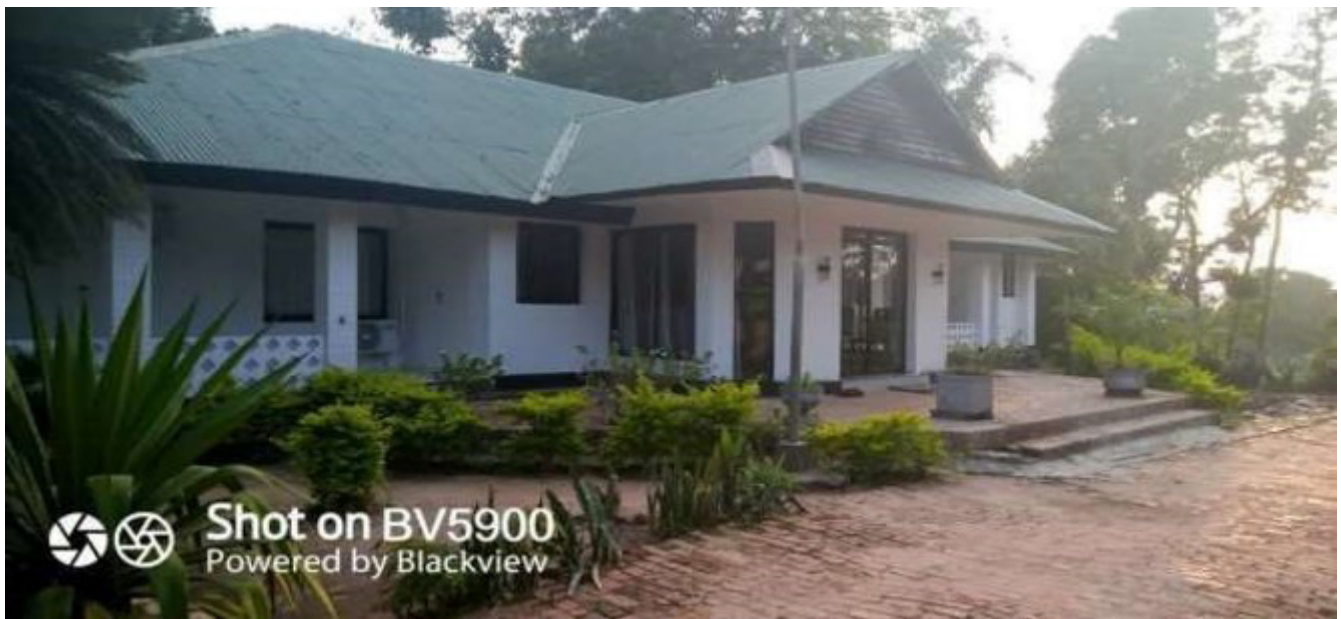
II.1 Guest house in LOKUTU

To better receive its national and international guests, PHC/KKM2 has built V.I.P. houses in all its sites (Lokutu, Yaligimba and Boteka) where it is nice to stay as shown in the photos below.