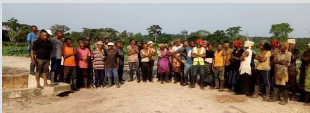
V.6.1 Work clothes during the FERONIA period

Work in plantations and factories is a high-risk job. That is why it is important to equip the agricultural workers with uniforms, boots and working tools to protect them effectively against work accidents. This safety aspect plays a crucial role in the production and performance of each worker. But unfortunately, the FERONIA group had ignored this aspect of things; the workers were left at the mercy of any work accident. It was even difficult to identify them because each one of them came to work wearing a uniform of his choice (see images below).