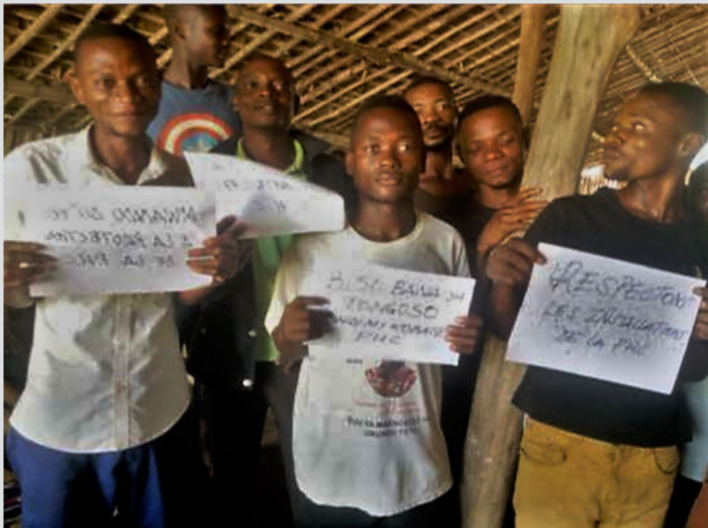
III.2 Awareness campaign