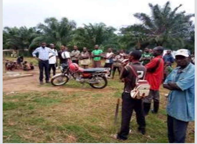
V.6.2 Work clothes during the FERONIA period

Nowadays, the KKM2 group solved this situation because all the agricultural workers wear the company's uniforms and work tools such as overalls, boots, helmets, gloves, machetes, etc., as shown in the photos below.